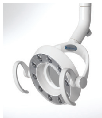
900 LED Series with Patient mirror option

Control all chair movements by hand or foot: by hand from both the Operator's and Assistant's console; by foot using the stalks built into the chair base. Spittoon functions and ON/OFF light control are also activated from both the Operator's and Assistant's console.