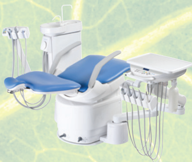
Cleo II 'Surgery System'