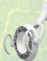
900 LED Series 920 LED unit-mounted 2