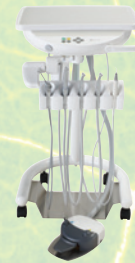
Mobile Cart 1