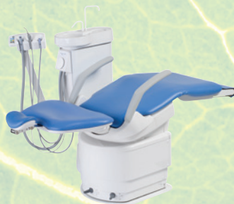
Cleo II 'Flexible System'