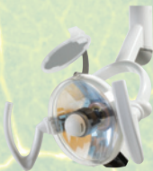
700 Series 720SLR unit-mounted 2