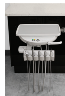
Mobile Cart and Module flexible options, 'A' and 'E' versions