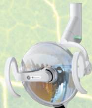
800 Series 820S unit-mounted 2